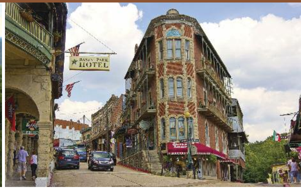
Above, l to r: Mildred B. Cooper Memorial Chapel, Bella Vista. Fay Jones, architect, 1987. The Crescent Hotel, Eureka Springs. Downtown Victorian-era Eureka Springs.

Depart 8:45 a.m. • Return 6 p.m. • Breakfast and dinner on your own, lunch included at the Crescent Hotel, Eureka Springs