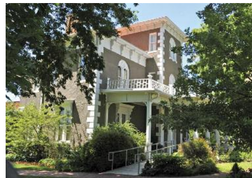
Colonel Samuel West Peel house, Bentonville, AR.

The front hall is a sophisticated presentation of rare pine graining and a gracefully turned walnut balustrade stairway. Authentically designed curtains and colors derived from meticulous research embellish this softly lighted Victorian interior of the 1870's. There is a rare Anglo-Japanese mantle in the library and unusual Greek Revival molded trim in the parlor. Kerosene lamps and chandeliers lighted the darkness in the Peel household of many years ago and careful attention to this reality has resulted in a display of unusual lighting devices complete with globes, chimneys, wicks and authentic period details. Rugs, coverlets, furniture, and other accessories create a truly authentic interior of the early Victorian period.