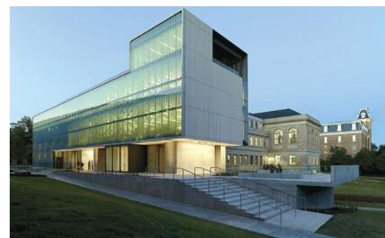
Above, top to bottom: Headquarters House, Fay Jones School of Architecture and Design, University of Arkansas.