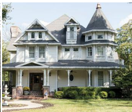
Cover: Crystal Bridges Museum of American Art. Moshe Safdie, architect, 2011. Above, l to r: Jackson House, Rice House, Victoria House, Bentonville, AR.